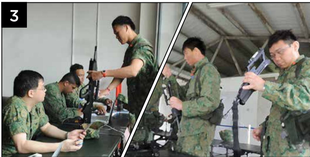
He draws his organic weapon and proceeds to the training station where he refreshes his drills in handling the weapon.