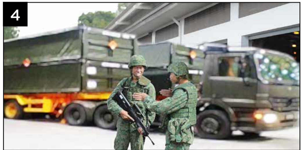
Ammunition is delivered by the SAF Ammunition Command and subsequently distributed to the NSmen. At the MEC, vehicles are kept at the storage facility within a Controlled Humidity Environment, which ensures the vehicles can move out at any time.